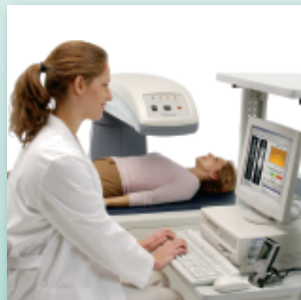
A total body exam provides precise bone density and body composition results in one scan.